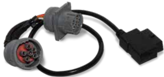
6-Pin Heavy-Duty T-Harness HRN-DS06T2