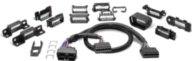
Universal OBDII T-Harness Kit HRN-GS16K2