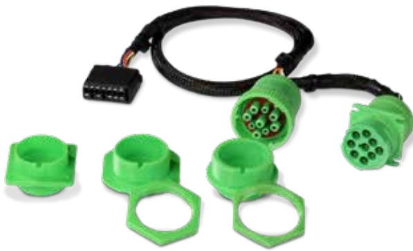
Universal Heavy-Duty T-Harness Kit HRN-GS09K2

Use this guide to identify the appropriate harness connector for your vehicle's make and model.